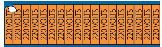
Style C: 2-1/4 in. x 1/2 in. (18 markers per card) Character Height 5/16 in.