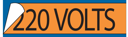
Style A: 2-1/4 in. x 9 in. (1 marker per card) Character Height 1-7/8 in.