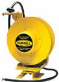
HBL501242W with HBL16PB