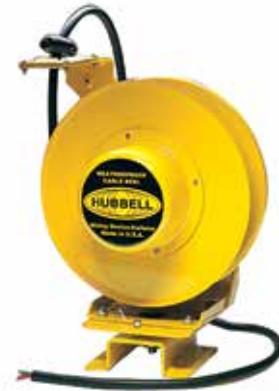
HBL501242W with HBL16PB