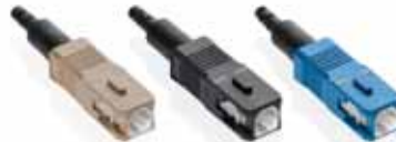
D E F