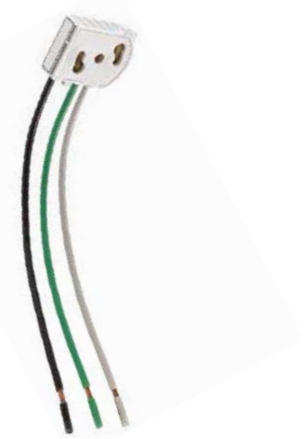
MSTWL-A Wiring Module