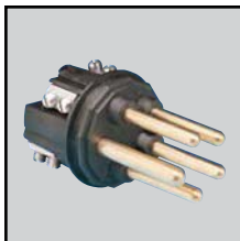
Pin & Contact Carrier, 60 & 100 Amp