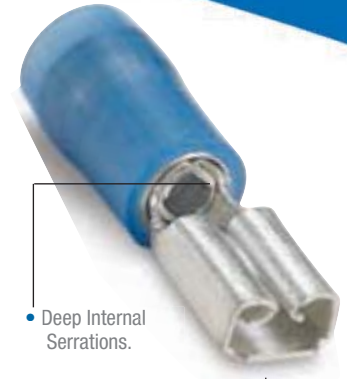
• Deep Internal Serrations.

Sta-Kon® Rings, Forks, Locking Forks, two-way splices and disconnects are tested and listed to UL standards and all applicable products to CSA standards.