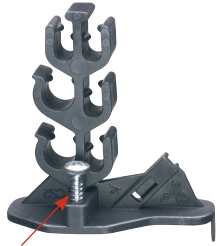
#8 self-tapping sheet metal screw CS20SC