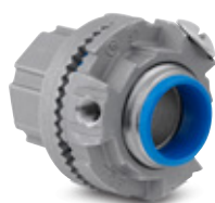
H050GRSST Stainless Steel Grounded Hub