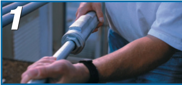
Slide the fitting onto the conduit until it stops at the internal sliding bushing. Tighten and you're ready. No parts to reassemble!