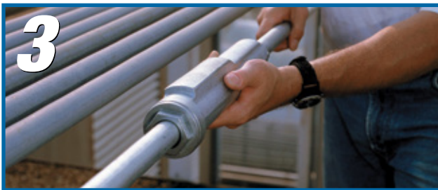
Thread the next length of conduit into the other end of the fitting and tighten. You're done!