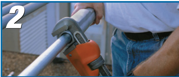
With a wrench, tighten the gland nut to compress the Teflon packing, creating a raintight seal around the conduit.