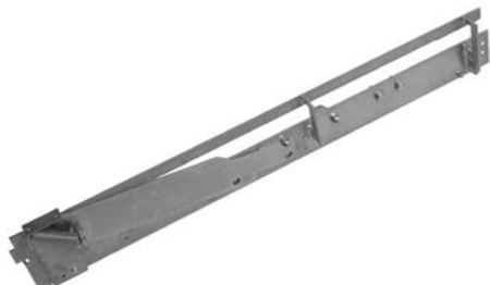
Stationary Rail Assembly