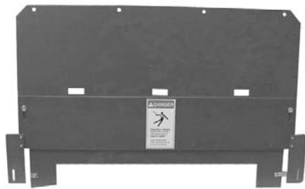
Shutter Assembly (CPT Assembly Shown)