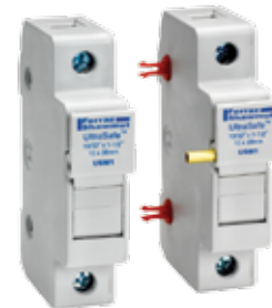
USM1 with USPTH Pin-Ties