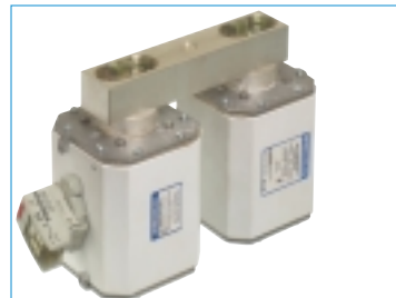
13,5 URD 294 TDSFF 3400 + MCR3E 1-5NBS

All fuses are standard with a low voltage blown fuse indicator. This indicator can operate a microswitch which is easily mounted directly onto the fuse in service.