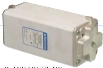
25 URD 123 TTF 630