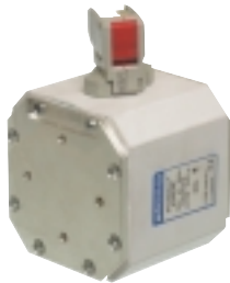
9,5 URD 94 PPASF 3800 + MCR3E 1-5N