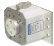
13 URD 84 TQFPLA 0900