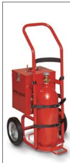
JO225LC & 1208 (20 lb Cylinder)