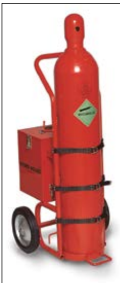
JO225LC & 950 (50 lb Cylinder)