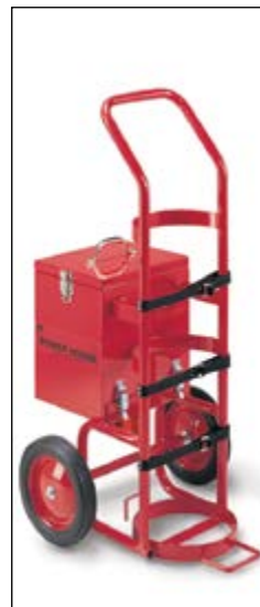
JO225LC Powr House™ CO 2 System w/o Cylinder