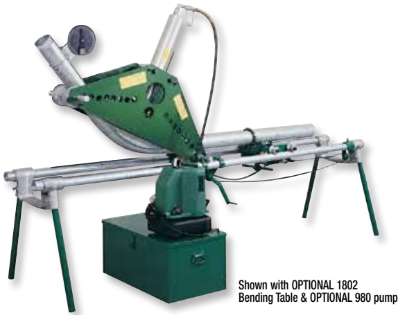
Shown with OPTIONAL 1802 Bending Table & OPTIONAL 980 pump