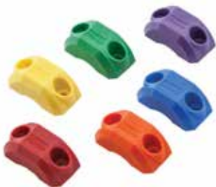
Dimensions in Inches (mm)