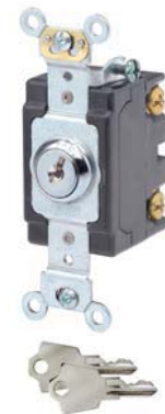
1221-2KL w/two keys