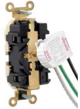
M5262-I with MSTWL-A