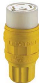
Connector for Single Inlet