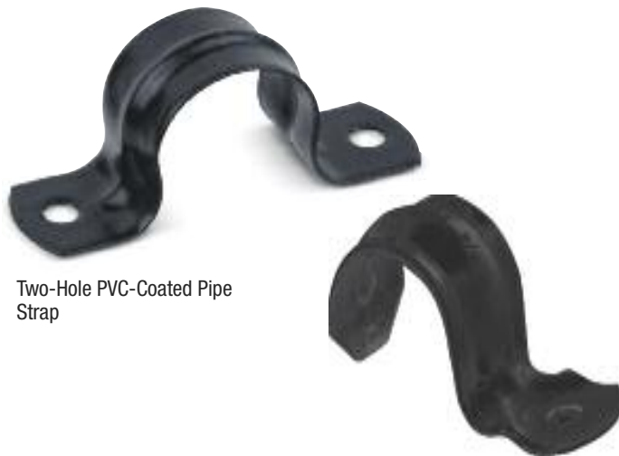
Two-Hole PVC-Coated Pipe Strap