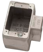
CIFSFS (1 face)