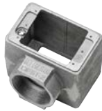
CIFSST (2 faces)