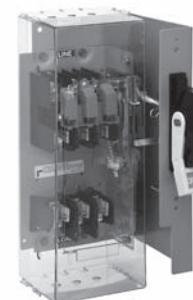
VBFS361F with HSK61 Installed