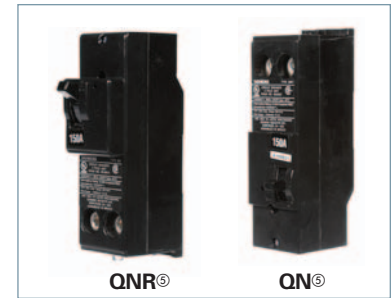
QNR ③ QN ③

Requires 4 panel spaces, 2 adjacent and 2 opposite. SHIPPING: 1 per carton (Wt. 3 lbs.)