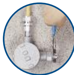
5. Insert adaptor on enclosure