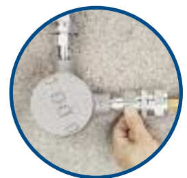
6. Insert assembly and tighten adaptor nut