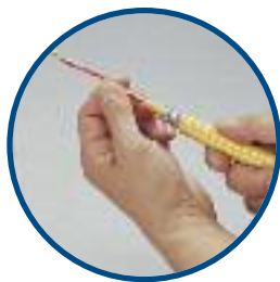
1. Prepare cable

TCAX™ fittings are easily installed, as no disassembly of the gland nut from the fitting body is required during installation. The fittings are individually packaged in kit form with everything needed for installation.