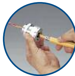
2. Install TCAX fitting on cable