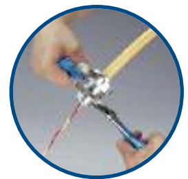
3. Tighten gland nut