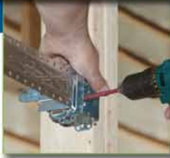
Screw bracket on box.