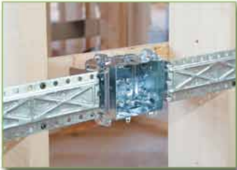
Solution between two studs.