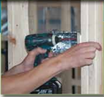
Screw box on stud.