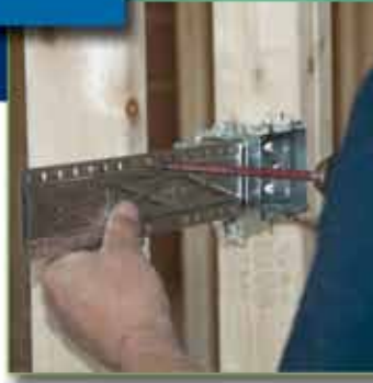
Screw bracket to opposite wood stud.