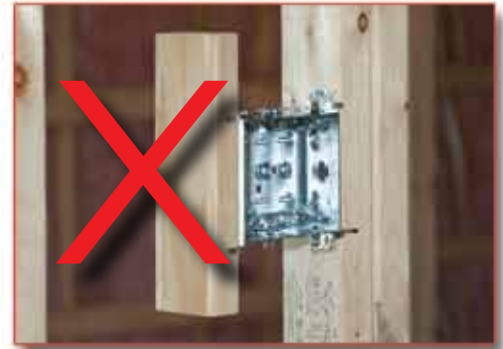
This installation does NOT COMPLY with C.E.C. 12-3010 (3).