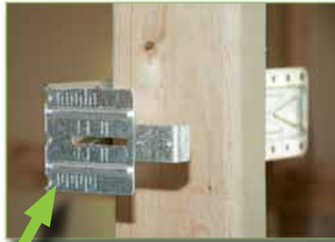
Using the guides built into the bracket, box depth can be adjusted to fit the application.