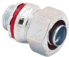
IT: with insulated throat