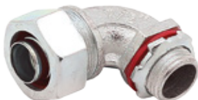
IT: with insulated throat