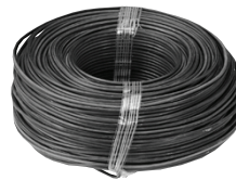
CIDUCT-1 / CIDUCT-5