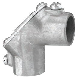
-G: with gasket.