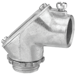
Zinc Die Cast Locknut