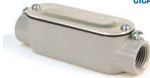
CICA-1/2 / CICA-2