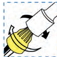
Can also be used with 1/2 in. or 13mm nut driver.